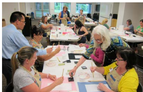
Fig.2 The Art Class Scenarios

When authors write art essays, the content of inheritance and development is indispensable. Therefore, if an author wants to write a thesis with depth and breadth, he will have to understand the appreciation of the classic art works, learn different artistic and cultural information, absorb the valuable artistic skills of his predecessors and form the basis His own unique insights, and constantly improve their own painting skills. Leonardo da Vinci, for example, is a well-known man who made so much of his accomplishments that extensive knowledge of one of important reasons for his success. To a certain extent as these knowledge nurtured his imagination and ability to perceive, while superb painting ability is also a manifestation of his comprehensive ability. With the implementation of the quality education policy and the speeding-up of the new curriculum reform, the current art teaching has changed the traditional “learning-ask” teaching mode, which can greatly promote the rapid development of the students. In the teaching practice activities, students can then get all-round development, various qualities and abilities can be effectively cultivated. However, at present, most art teachers still pay attention to the teaching of art knowledge, emphasizing on the teaching of knowledge, not paying attention to practical operation, not to open up new ways of imparting knowledge.